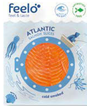
Atlantic salmon cold smoked slices VAC | 100 g