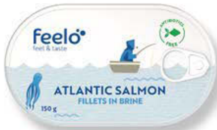
Atlantic salmon fillets in brine | 150 g