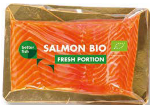
Atlantic BIO salmon portion skin-on VAC | 300 - 400 g