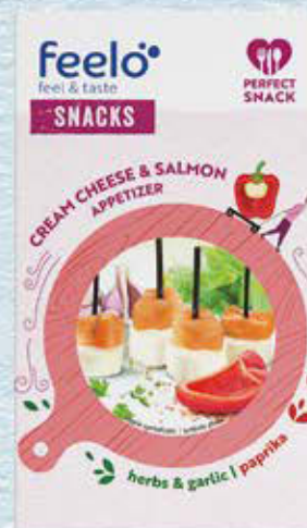
Cream cheese & salmon appetizer herbs & garlic paprika | 80 g