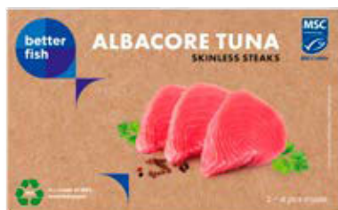
Albacore tuna MSC skinless steaks box | 180/200 g