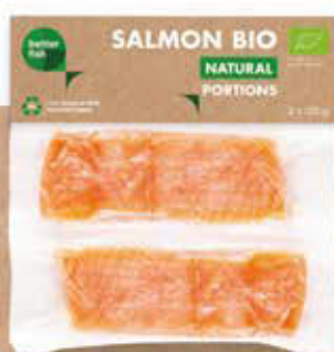
Atlantic BIO salmon portions skin-on chainpack | 2 x 125 g