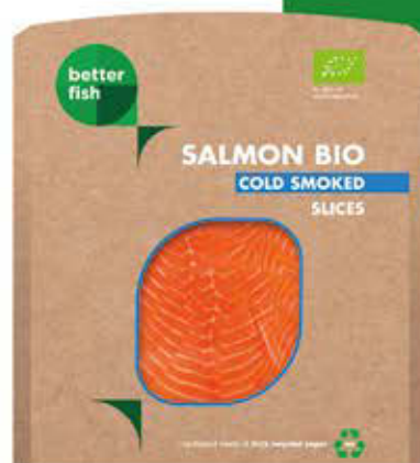
Atlantic BIO salmon cold smoked slices sleeve VAC | 100 g