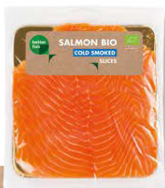
Atlantic BIO salmon cold smoked slices VAC | 100 g