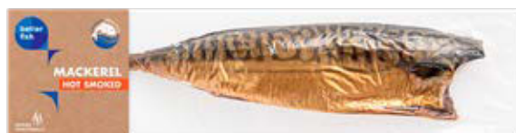
Whole mackerel headless hot smoked (smoked traditionally) | 250–400 g