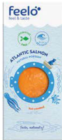
Atlantic salmon natural portion hot smoked | 125 g