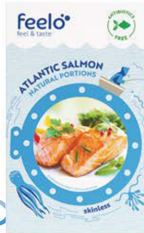
Atlantic salmon natural skinless portions | 2x100 g