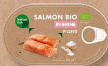
Atlantic BIO salmon fillets in brine | 150 g