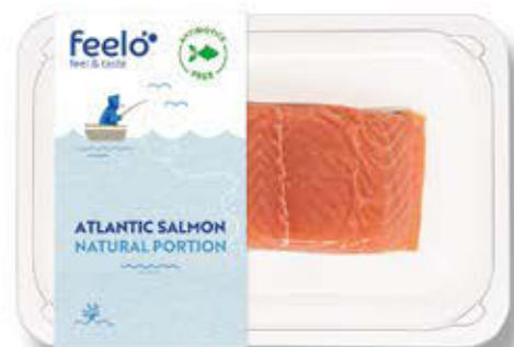
Atlantic salmon natural portion skin-on MAP

Another asset is a broad selection of Feelo assortment, including fish products without antibiotics, vegan and vegetarian products, ready dishes, snacks, etc. Feelo, naturally!