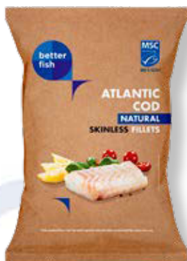
Atlantic cod MSC skinless fillets bag | 475/500 g