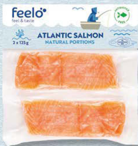
Atlantic salmon natural portions skin-on chainpack