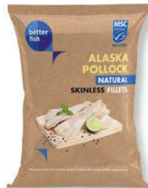
Alaska pollock MSC skinless fillets bag | 450/500 g