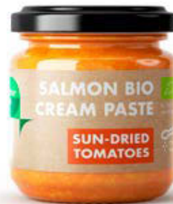
Salmon BIO cream paste sun-dried tomatoes | 90 g