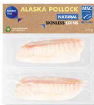
Alaska pollock MSC skinless loins chainpack | 225/250 g