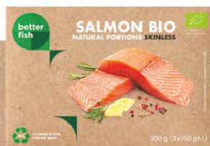
Atlantic BIO salmon portions skinless box | 2 x 100 g