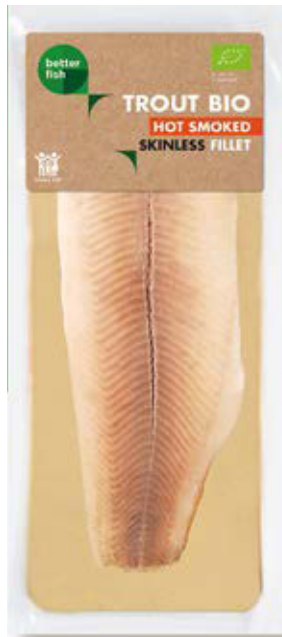
Trout BIO hot smoked fillet(s) | 200-300 g VAC