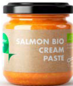
Salmon BIO cream paste | 90 g