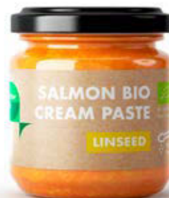
Salmon BIO cream paste linseed | 90 g