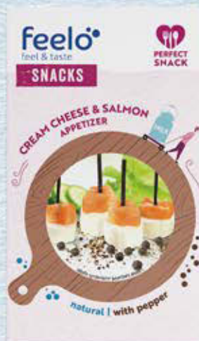
Cream cheese & salmon appetizer natural with pepper | 80 g