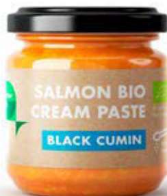
Salmon BIO cream paste black cumin | 90 g