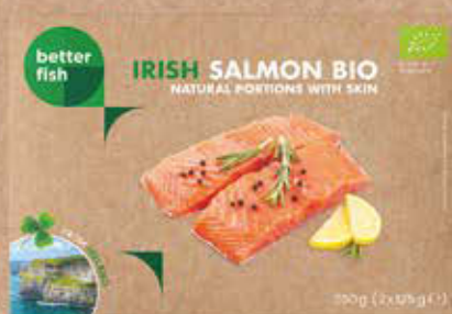
Atlantic Irish BIO salmon portions skin-on box | 2 x 125 g