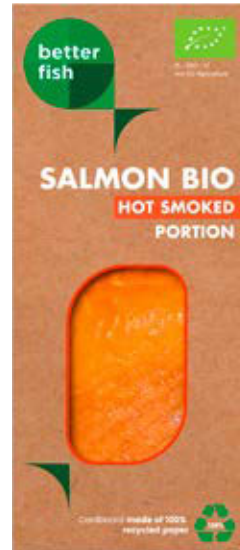
Atlantic BIO salmon hot smoked portion | 100 g natural MAP