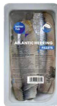
Atlantic herring salted fillets in oil (no preservatives) | 256 g