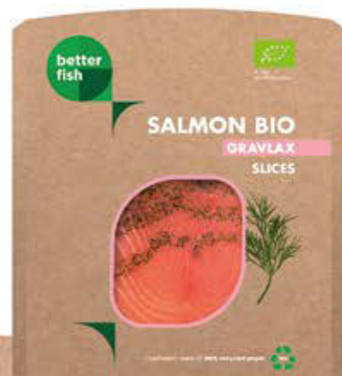
Atlantic BIO salmon GRAVLAX with dill slices sleeve VAC | 100 g