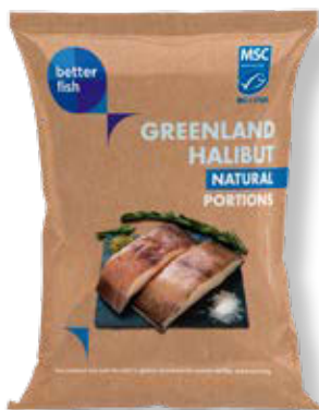
Greenland halibut MSC skin-on portions bag | 450 g