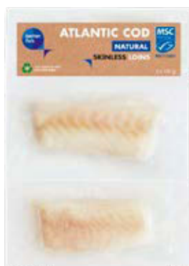
Atlantic cod MSC skinless loins chainpack | 250 g