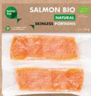
Atlantic BIO salmon portions skinless chainpack | 2 x 125 g